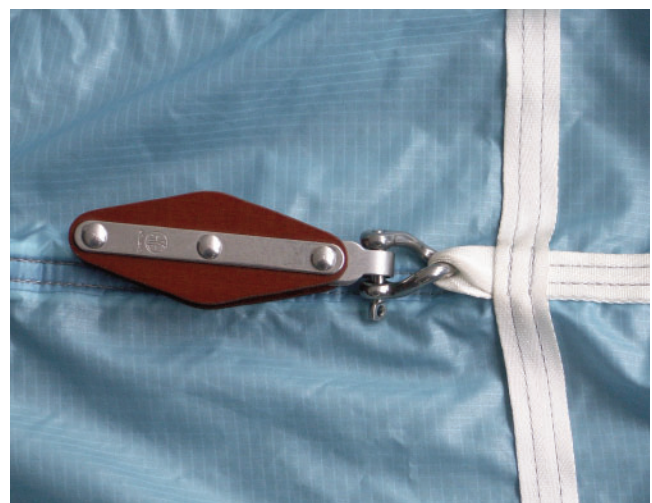
▲ Fig 7.53.2