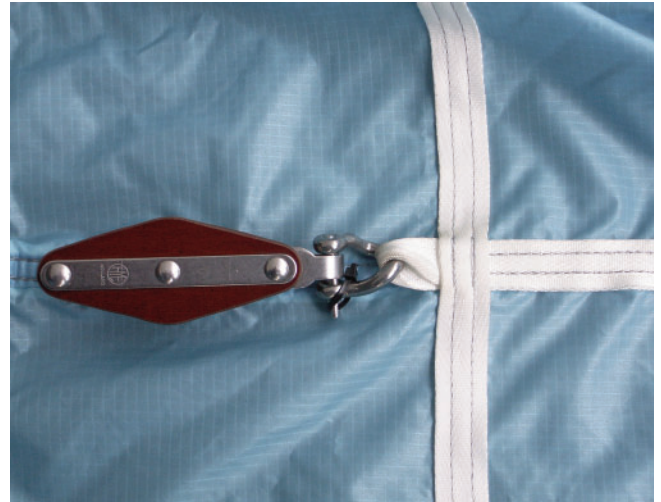
▲ Fig 7.53.4