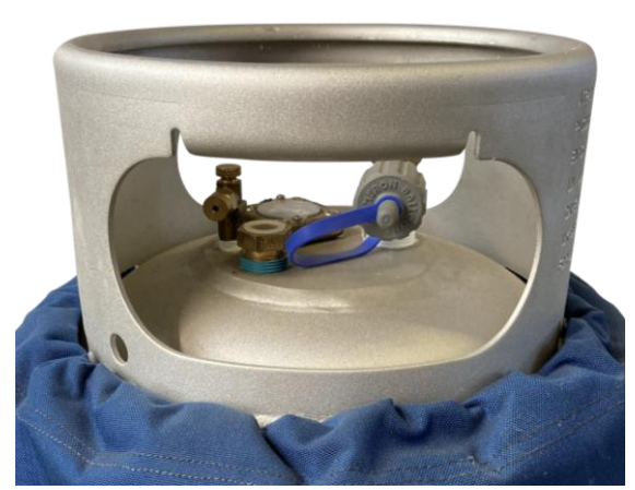
CB2990 Issue A cylinder (withdrawn)