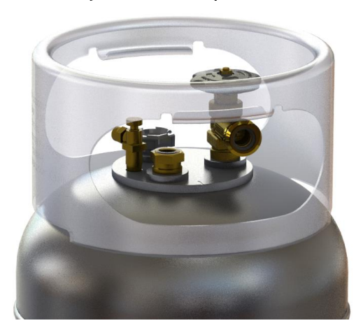
CB2990 Issue B cylinder

Cylinder Valve Plate: The cylinder valve plate of the CB2990 Issue B cylinder is raised above the dished end of the cylinder and has raised valve bosses. The Issue A cylinder valve plate has a flat top and is welded flush with the dished end.