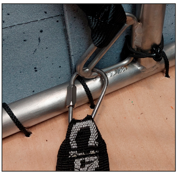
Harness bottom frame attachment